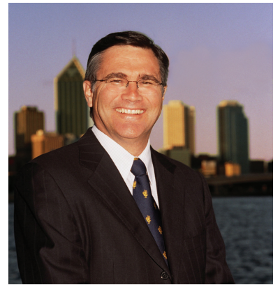
Dr Geoff Gallop, Premier of Western Australia

DR GEOFF GALLOP MLA PREMIER MINISTER FOR CITIZENSHIP AND MULTICULTURAL INTERESTS